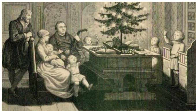
yte.fr/joyeux-noel/; sketch, Carl August Schwerdgeburth [1845].)